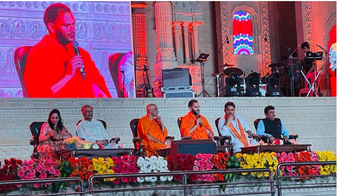
BENGALURU Habba 2022