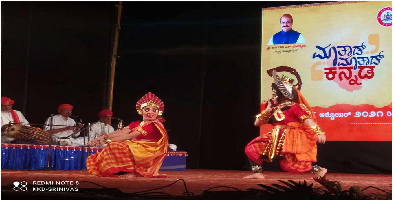
Programme at Ravindra Kalakshethra Bangalore on 2 nd Nov 2021. Staged Dr Shivarama Karantha's Yaksagana Byale "PANCHAVATI" FOR KARNATAKA SAMSKRUTHIKA UTHSAVA 2021 organised by Department of Kannada and Culture