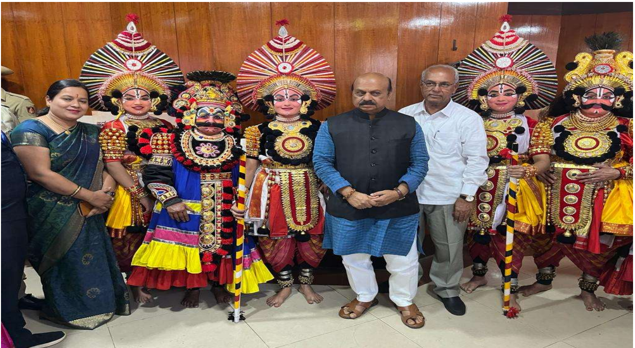
Artists with Sri S R Bommai, Hon .Chief Minister of Karnataka after the programme