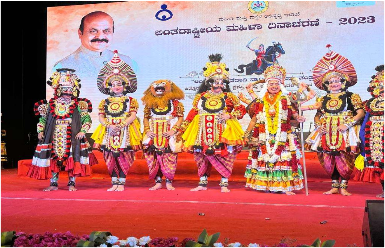
International Womens Day 2023, Celebration organized by State Women and Child Development Department ,Govt of Karnataka