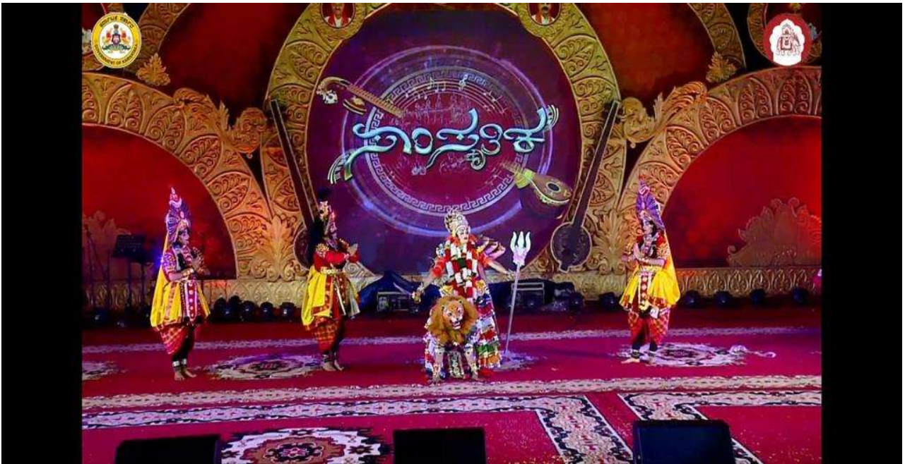
Programme in front of Mysore Palace for World famous Mysore Dussera 2022 By our troupe