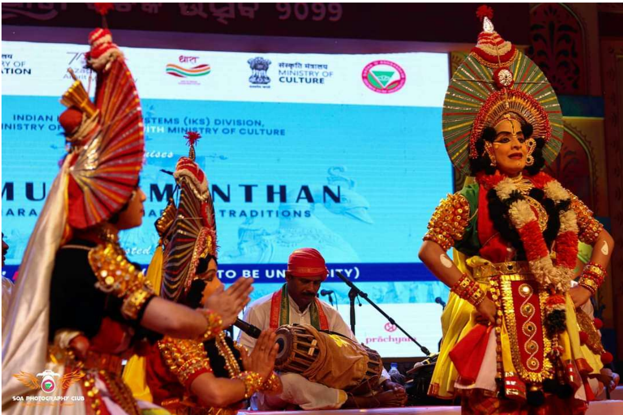
Programme in BALI UTHSAVA 2022

KARNATAKA MAHILA YAKSHAGANA [R], BANGALORE www.mahilayakshagana.com