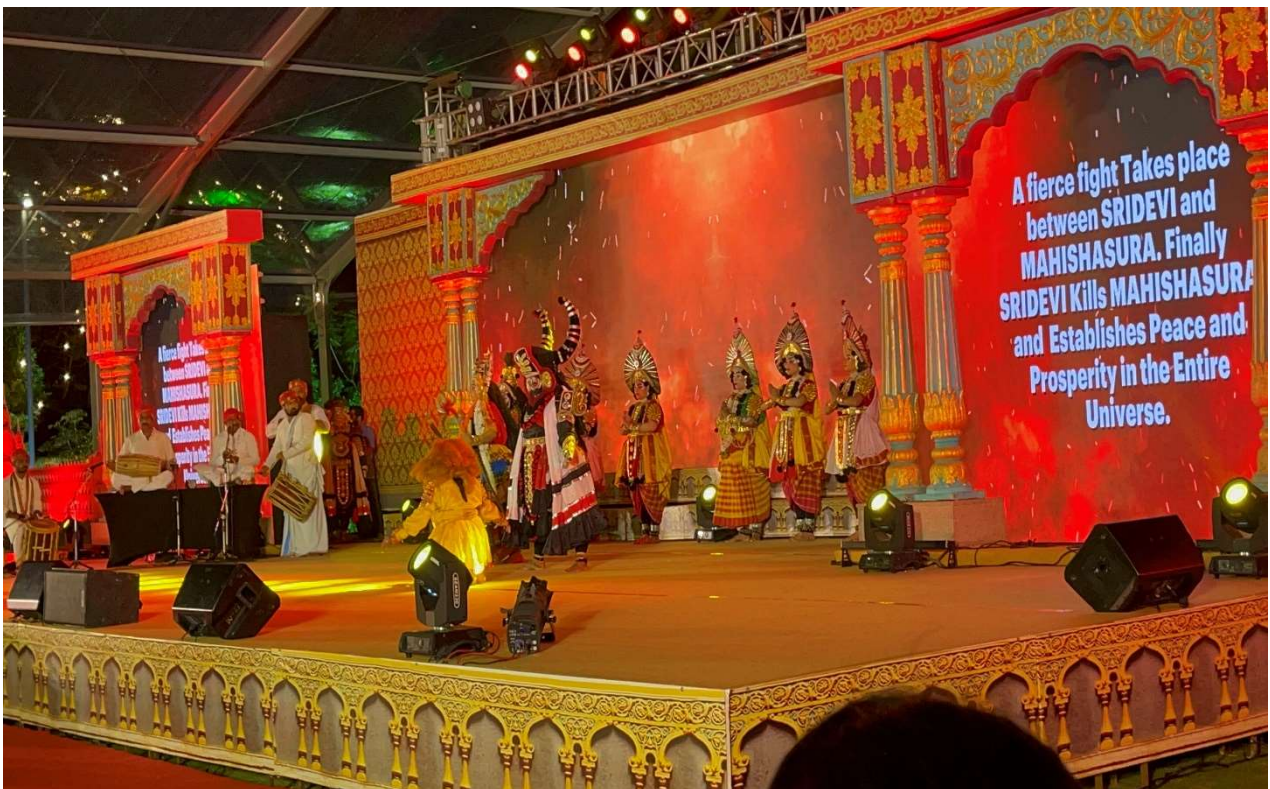
Programme for G 20 Summit organized by ICCR New Delhi

KARNATAKA MAHILA YAKSHAGANA [R], BANGALORE www.mahilayakshagana.com