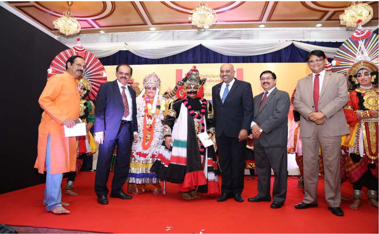
Presented “ Sri Devi Mahathme “ on the occasion of Founders day celebration