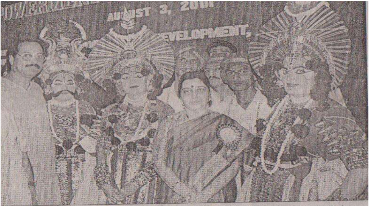
'ಮಹಿಳಾ ಸಂವರ್ಧನಾ ವರ್ಷ-2001' ಕಾರ್ಯಕ್ರಮ ಇತ್ತೀಚೆಗೆ ಬಳ್ಳಾರಿಯಲ್ಲಿ ನಡೆಯಿತು. ಬೆಂಗಳೂರಿನ ಕರ್ನಾಟಕ ಕಲಾದರ್ಶನಿ ಯಕ್ಷಗಾನ ತಂಡದ ಮಹಿಳಾ ಕಲಾವಿದರು ಕಂಪವಧಿ ಯಕ್ಷಗಾನ ಪ್ರದರ್ಶನ ನೀಡಿದರು. ಈ ಸಂದರ್ಭದಲ್ಲಿ ಕಲಾವಿದರೊಂದಿಗೆ ಕೇಂದ್ರ ಸಚಿವೆ ಸುಷ್ಮಾ ಸ್ವರಾಜ್.