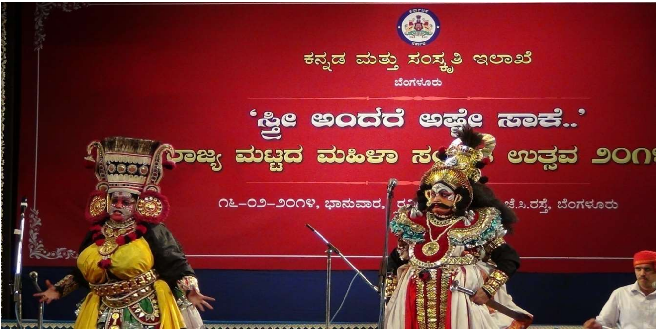
Troupe performing in “State level Mahila Cultural Programme 2014” organized by Department of Kannada and Culture Govt of Karnataka.