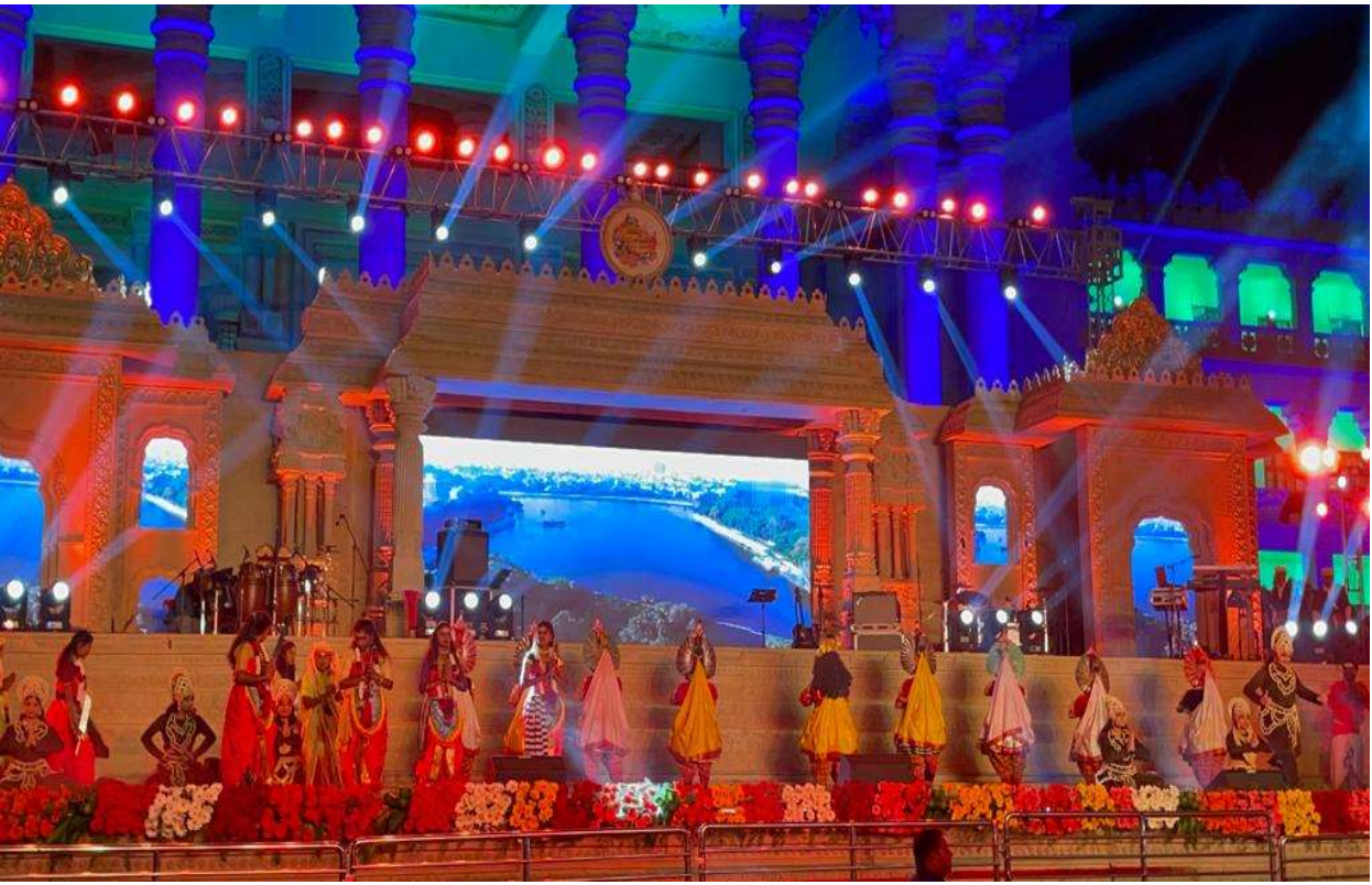
Programme in BENGALURU HABBA 2022 Organised by Dept of Kannada and Culture, Govt Of Karnataka