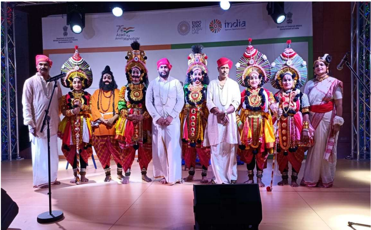
Selected by ICCR ,Ministry of external affairs Govt of India to presented programme for DUBAI EXPO 2020 at DUBAI in Indian Pavilion from 13 th October 2021 to 15 th October 2021