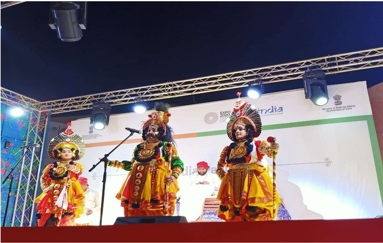
LAVA -KUSHA SRIRAMA DARSHANA PRASANGA presented in DUBAI