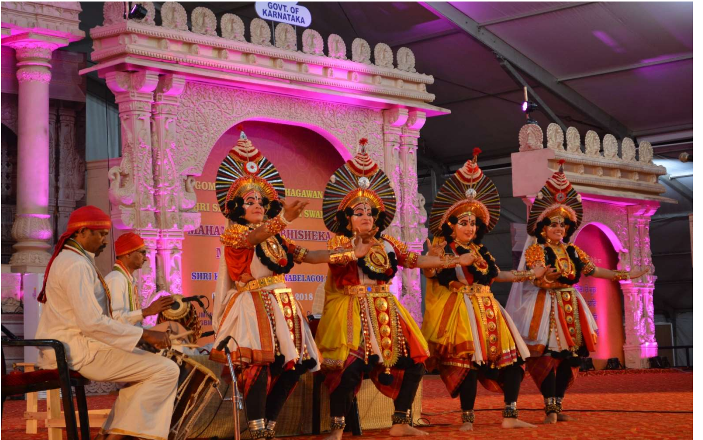
Performed in prestigious “Mahamasthakabhisheka uthsava 2018 at Shravanabelagola