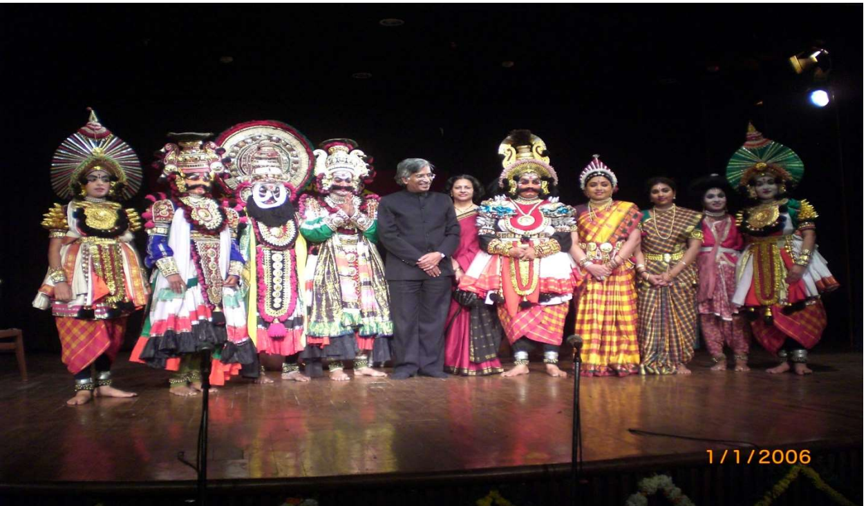
Troupe with Director, Indian Council for Cultural relations, New Delhi after a performance for HORIZON CULTARAL EVENT