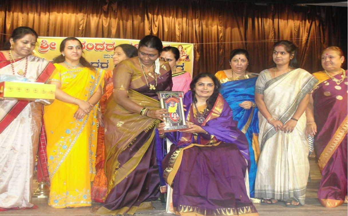
Felicitated on the occasion of Women's day Celebration