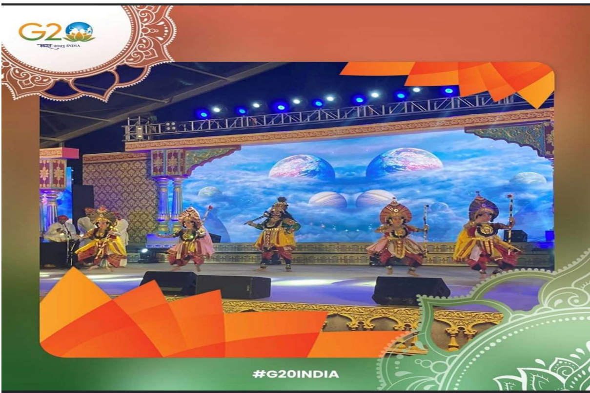
Presented programmes for G 20 Summit in Bangalore