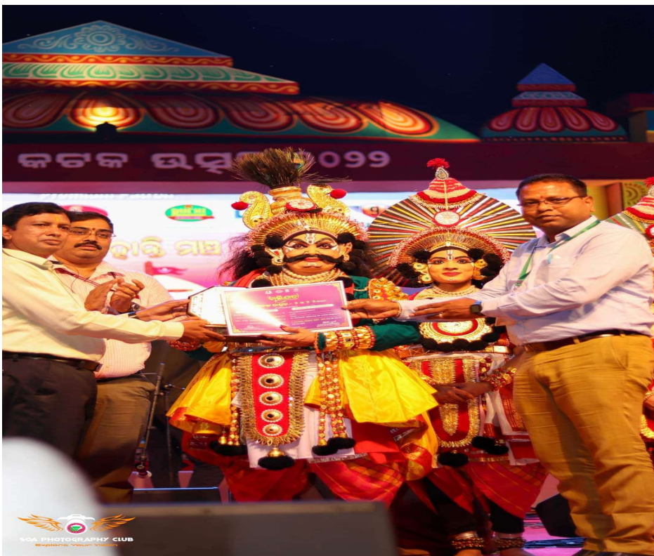
Receiving honour from Sri Ganti Murthy Ji of IKS and DC of Cuttack at BALI UTHSAVA 2022 ORGANISED BY Ministry of Culture , Govt of India