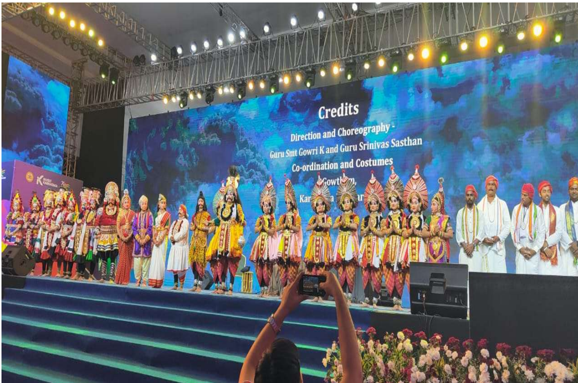
Programme for INVEST INDIA 2022 Organised by Department of Industries and Commerce, Govt of Karnataka